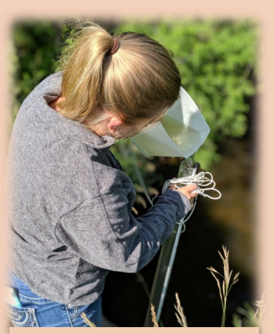
Monitoring County Ditch 60

The MPCA will use the data collected to determine if the water bodies tested meet the state standards for designated uses such as swimming and fishing. If any of the waters do not meet the standards they will be identified for protection or restoration in the next Chippewa Watershed Restoration and Protection Strategies (WRAPS) report that will be completed by the MPCA.