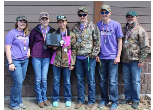
Nevis High School, North Central Area They competed at the North American Envirothon in Ontario, Canada in the summer of 2016